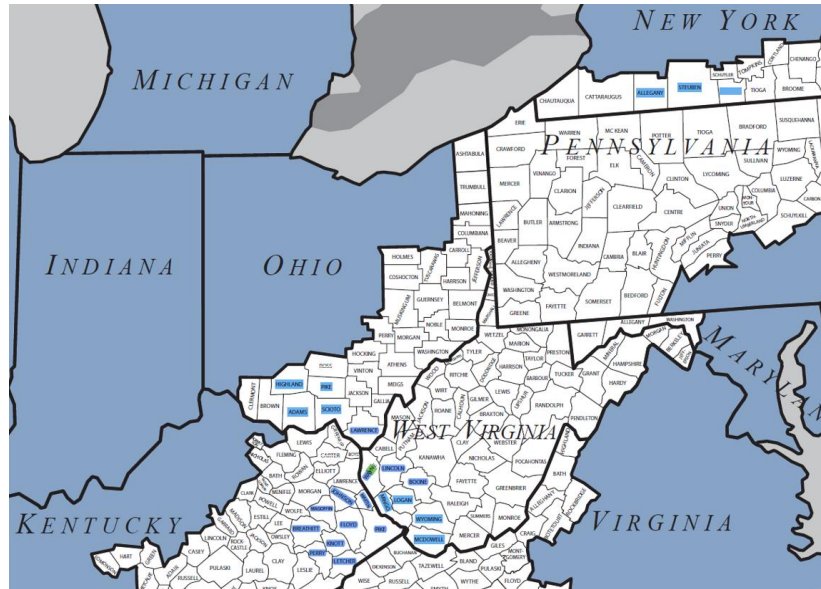
Source for map: Appalachian Regional Commission (highlighting added)