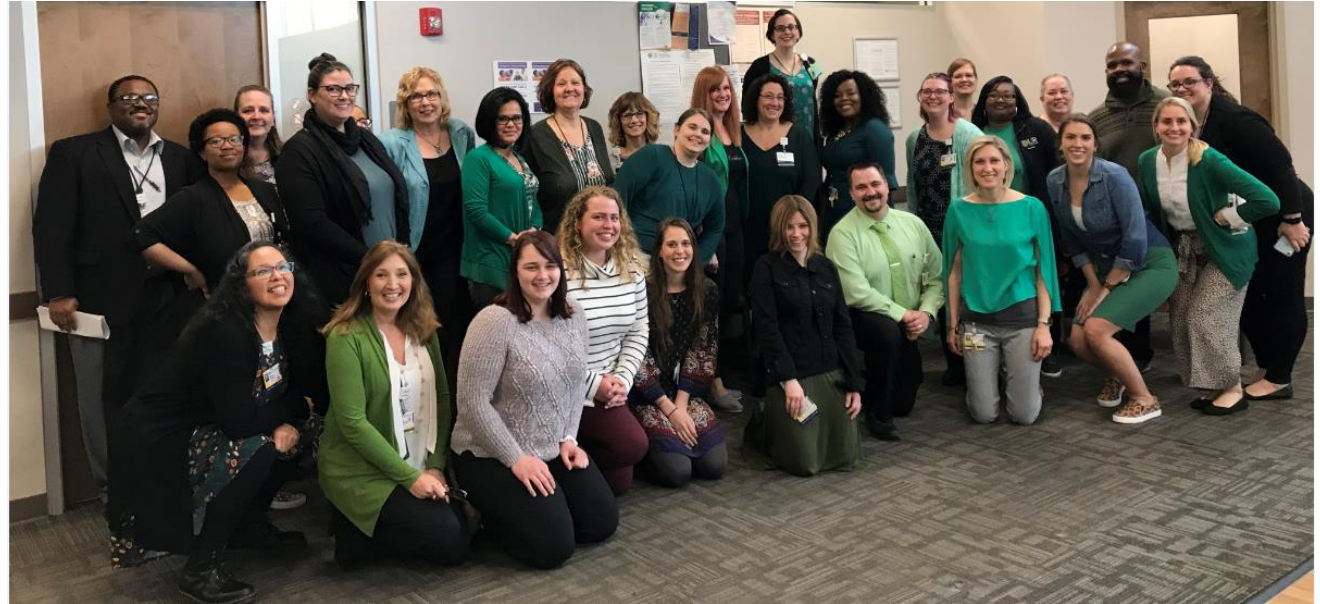
Strong Recovery staff on World Mental Health Day, October 2019