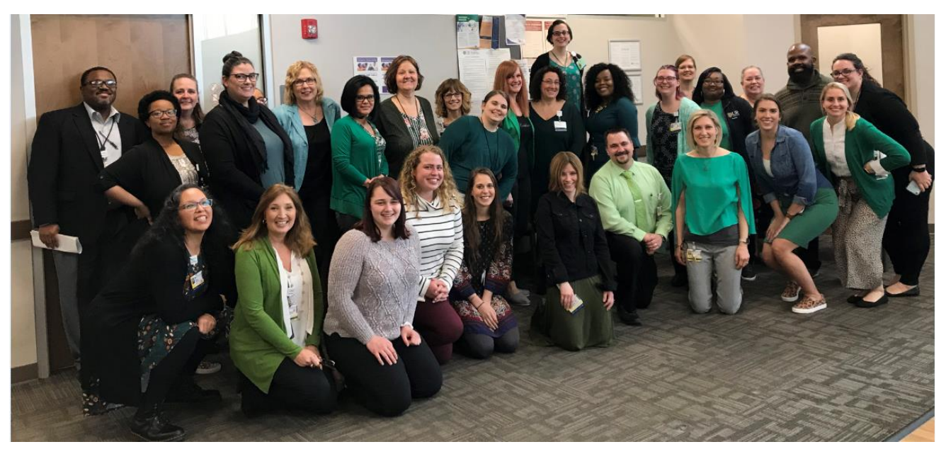
Strong Recovery staff on World Mental Health Day, October 2019